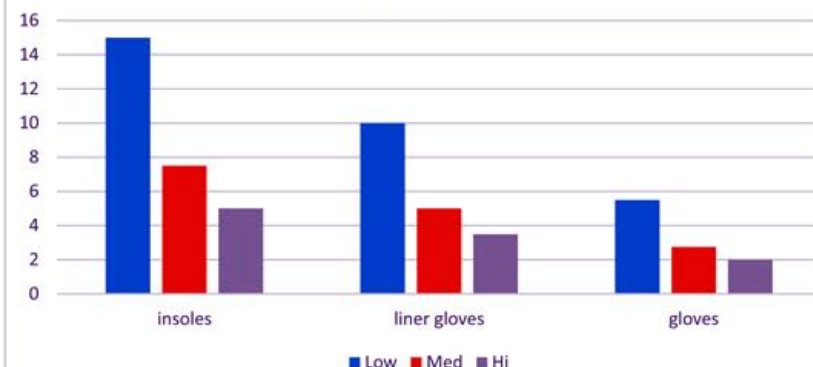
Hours of autonomy w/ Nano controller and...

***Attention, heated equipment and/or battery bag sold separately***